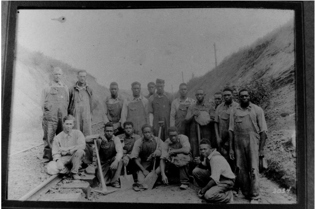
L&N Depot Workers

The Louisville and Nashville (L&N) railroad system in Etowah, Tennessee was first established in 1906. The town flourished after the L & N railroad, with businesses lining up throughout the downtown. Families flooded into the area taking advantage of the opportunity for work. Black families migrated also to the area for work. Soon Parkstown was established as a community for the Black residents of Etowah.