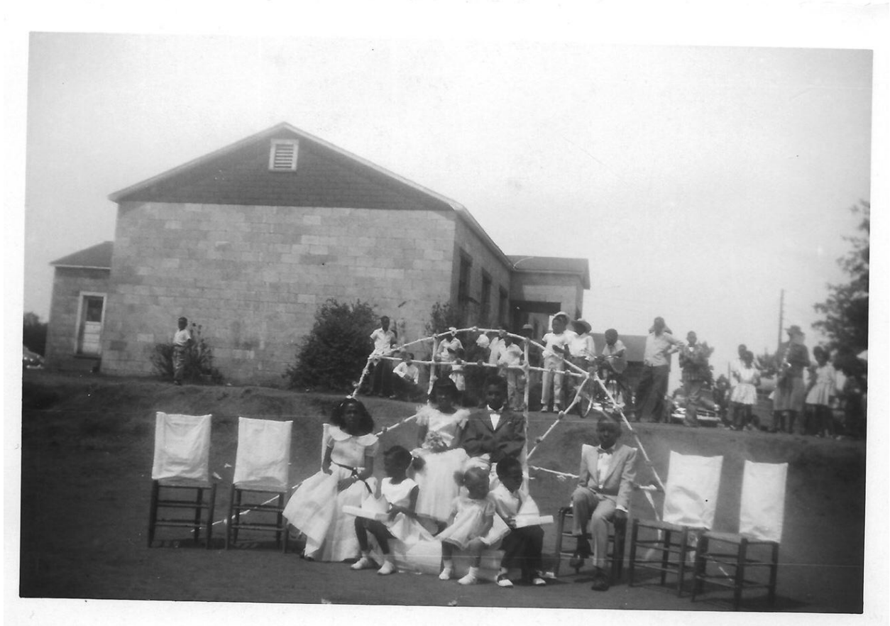
Parkstown School May 1955

Mayday is was a celebration marking the beginning of the summer. It was a vibrant celebration where the kids dressed in their nice church clothes, wore floral decore, and danced around the mayday pole. Their was even the selection of a king and queen.