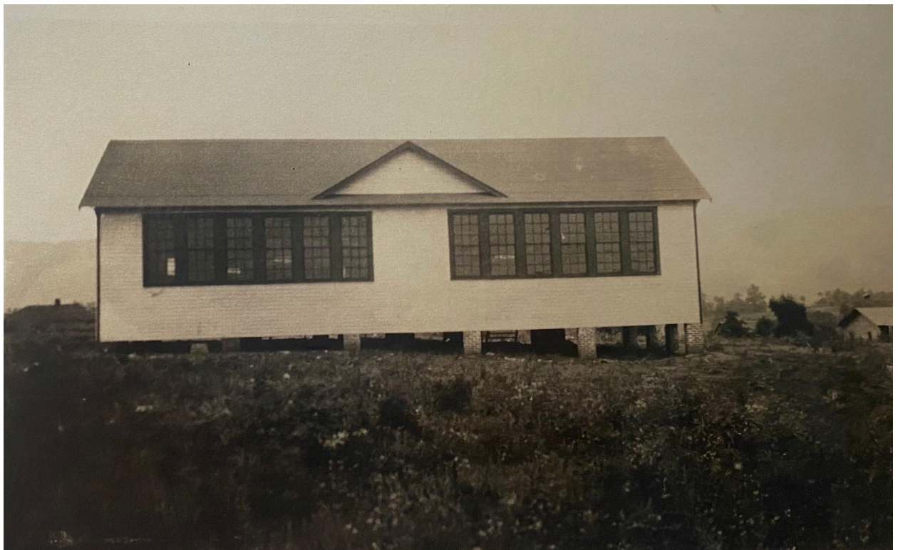
Parkstown/ West Etowah Rosenwald School